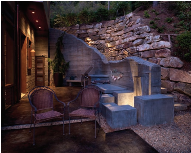
Step lights provide safety on the stairway while an underwater light accents the water feature.

When talking with your clients about landscape lighting, explain the benefits that lighting can bring to their home. Have them look at their beautifully landscaped yards during the day, then ask them to remember how that beauty disappears at night. Landscape lighting can transform this black hole into a visually stimulating and safe landscape.