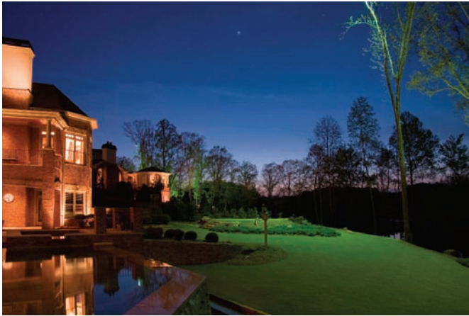
Moon lighting of the lawn with back architectural lighting reflected in pool.